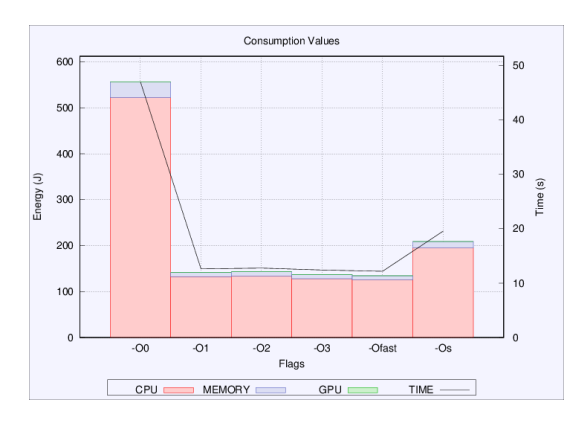
Fig. 3 Results of Pbrt measurements (C++ program)