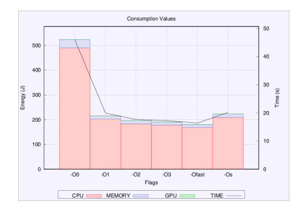
Fig. 2 Results of Oggenc measurements (C program)