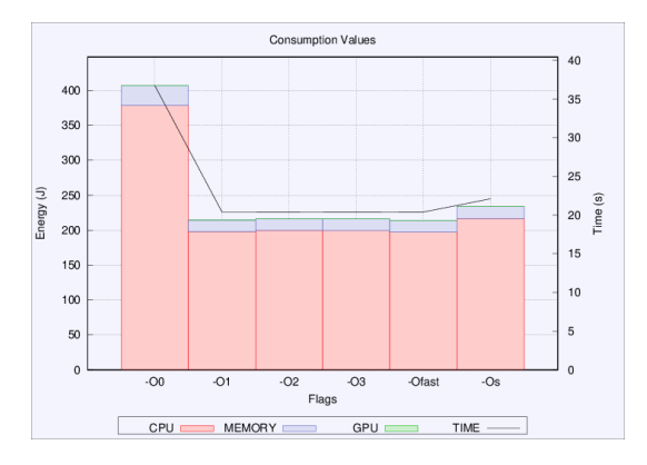
Fig. 1 Results of Bzip measurements (C program)